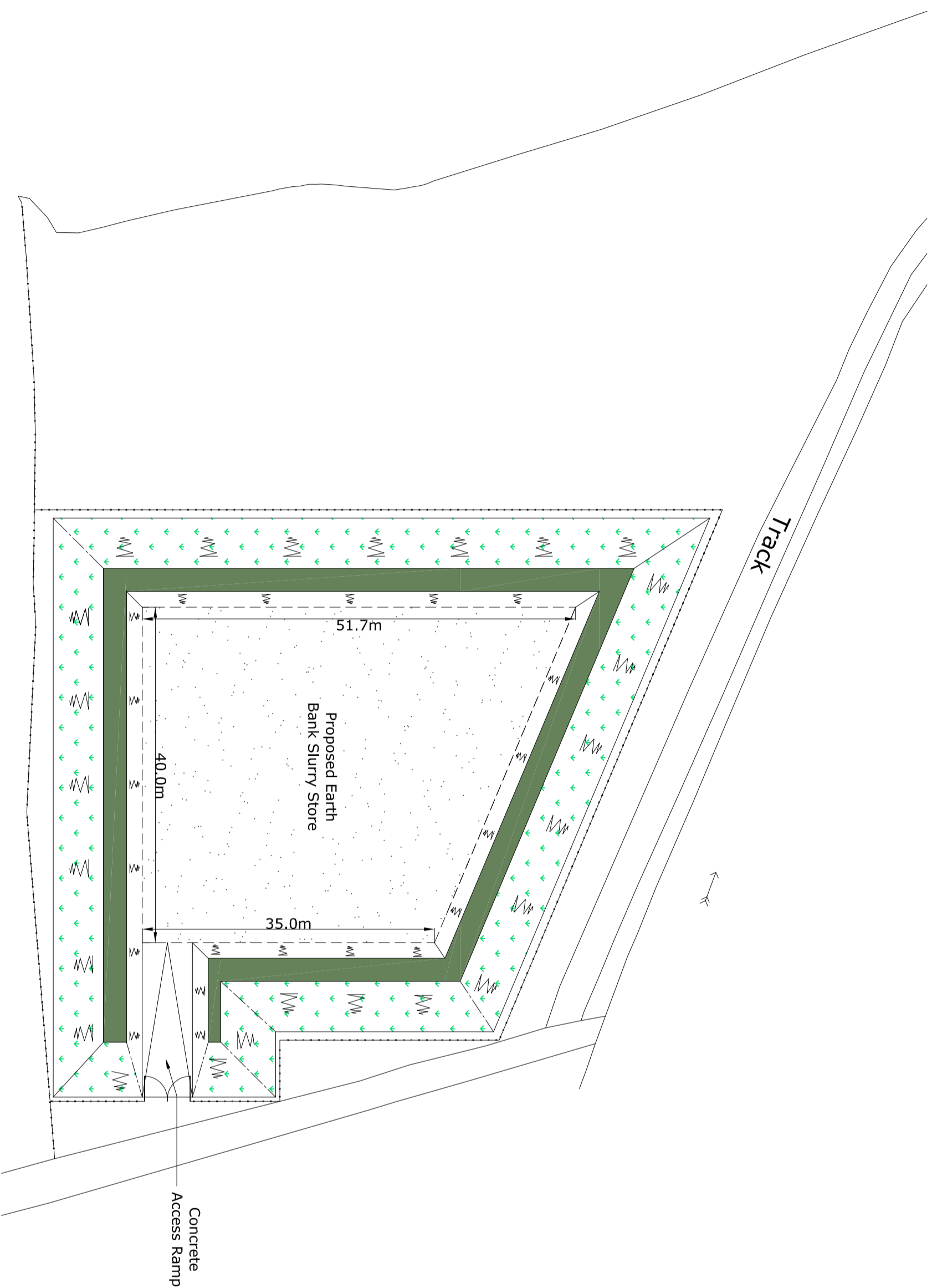
Proposed Plan of Earth Bank Slurry Store - (Scale 1:500)